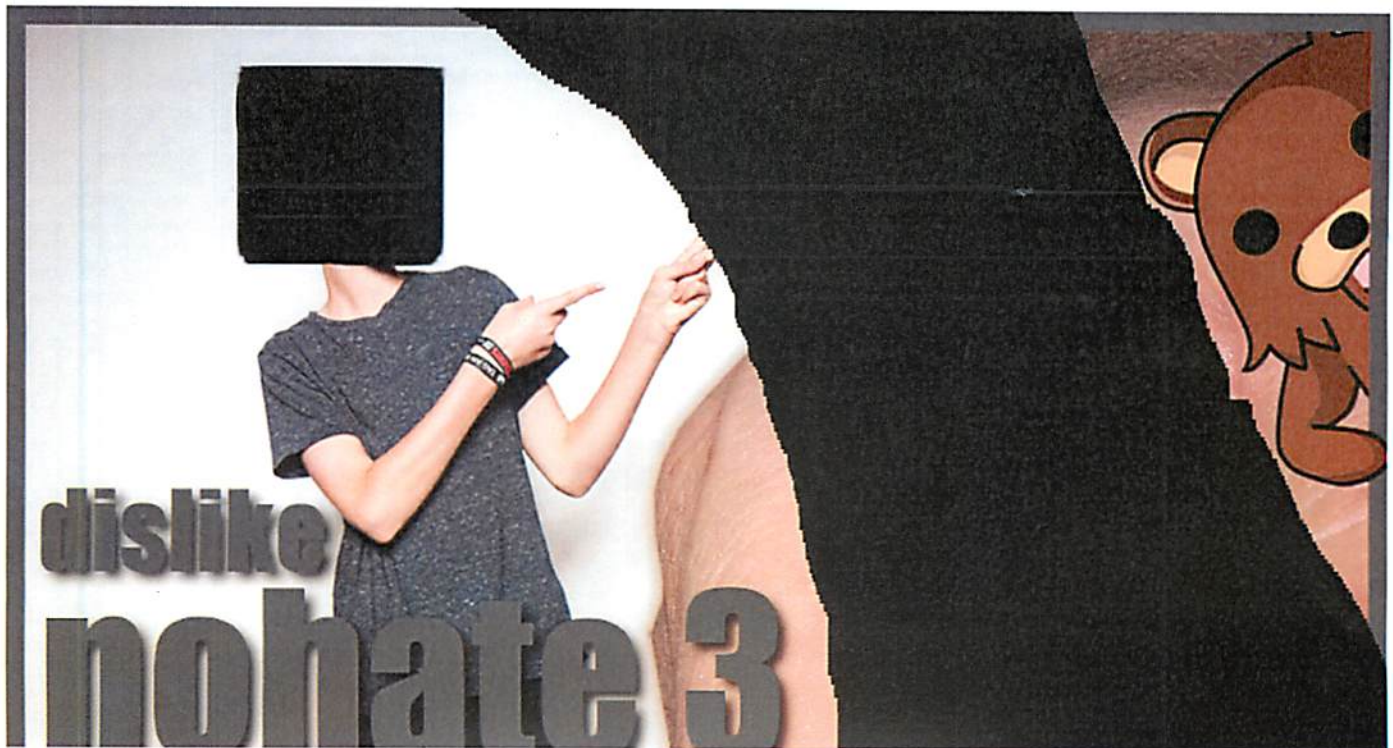
The Original YouTube Video Image. (original Image Available to Federal Judge).