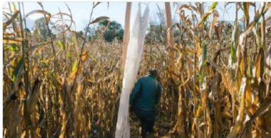
Bud Light Gets Eartul From Angry Corn Lobby After Super Bowl Ad Bud Light's Super Bowl campaign called out competitors that use corn syrup – and the corn lobby is not happy about it. bloomberg.com