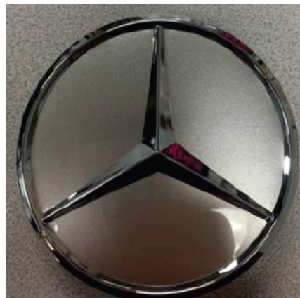
12 Infringing Product Purchased from Amazon

13 35. Daimler inspected all center wheel caps purchased and received from 14 Amazon to confirm that they are not genuine products manufactured or authorized 15 by Daimler, its subsidiaries, or licensees. The inspection of the purchased items 16 confirmed that the items Amazon advertised, sold, and shipped were in fact not 17 Daimler-authorized or Daimler-manufactured products.