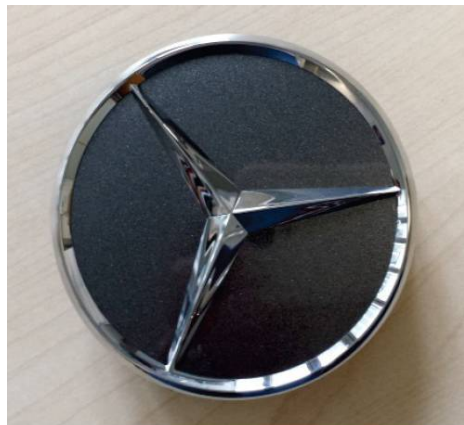
11 Genuine Mercedes-Benz Wheel Center Cap

1 herein, and the corresponding Amazon product detail pages (see Ex. N ). A photo of 2 one of the Infringing Products is reproduced below next to a photo of a genuine 3 Mercedes-Benz wheel center cap: