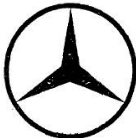
19 20 U.S. Reg. No. 789,670 Registered May 18, 1965