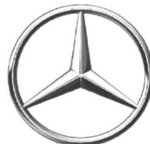
27 28 U.S. Reg. No. 4,423,458 Registered October 29, 2013