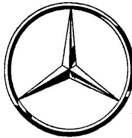
13 14 U.S. Reg. No. 661,311 Registered May 6, 1958

1 motor trucks, and parts thereof (the “Mercedes-Benz Marks”). True and correct 2 copies of the registration certificate, renewal notice, and abstracts of title for the 3 Mercedes-Benz Marks are attached hereto as Exhibits A-M and incorporated herein 4 by reference. The Mercedes-Benz Marks were registered with the U.S. Patent and 5 Trademark Office (“USPTO”) on May 6, 1958 (No. 661,311); May 18, 1965 6 (No. 789,670), January 7, 1986 (No. 1,377,179), May 5, 2009 (No. 3,614,891), and 7 October 29, 2013 (No. 4,423,458), and are currently in force.