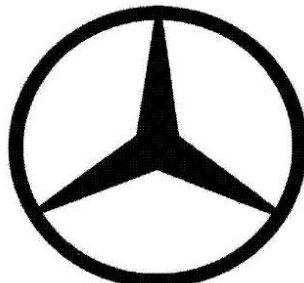
25 26 U.S. Reg. No. 3,614,891 Registered May 5, 2009