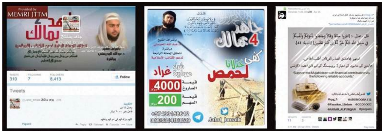
Fundraising Images from Twitter Accounts on ISIS

will earn the title of ‘gold status donor.’” According to various tweets from the account, over 26,000 Saudi Riyals (almost $7,000) were donated.