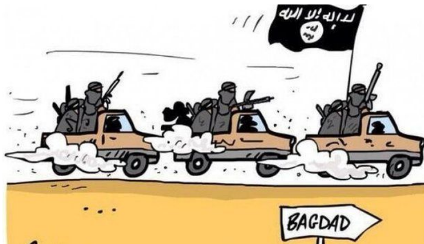
28 ISIS Propaganda Posted on @ISIS_Media_Hub

19 5. Another Twitter account, @ISIS_Media_Hub, had 8,954 followers as of September 20 2014.