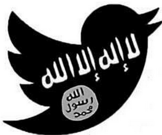
16 An Image Used by ISIS Supporters Combines 17 the Twitter Logo with the ISIS Flag