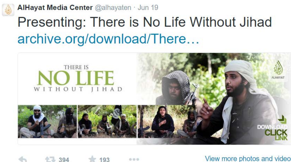
10 11 12 13 14 15 16 17 Tweet by Al-Hayat Media Center Account @alhayaten 18 Promoting an ISIS Recruitment Video

6 4. Likewise, Al-Hayat Media Center, ISIS's official public relations group, maintained 7 at least a half dozen accounts, emphasizing the recruitment of Westerners. As of June 2014, Al- 8 Hayat had nearly 20,000 followers.