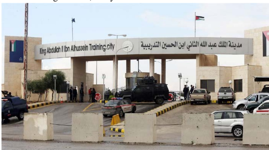
9 10 11 12 13 14 15 16 Entrance to the International Police Training Center in Amman, Jordan