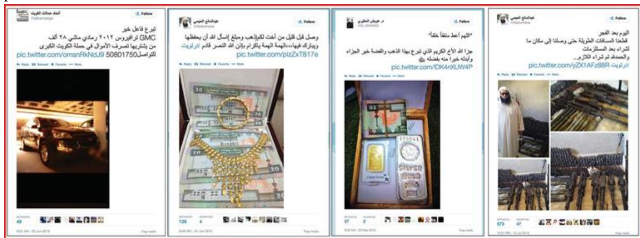
Donations to ISIS Publicized on Twitter

34. In its other Twitter fundraising campaigns, ISIS has posted photographs of cash, gold bars and luxury cars that it received from donors, as well as weapons purchased with the proceeds.